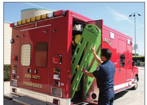
Fits in a standard backboard compartment

CombiCarrier II® The next generation Scoop / Backboard