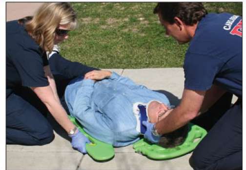
Functions like a scoop stretcher